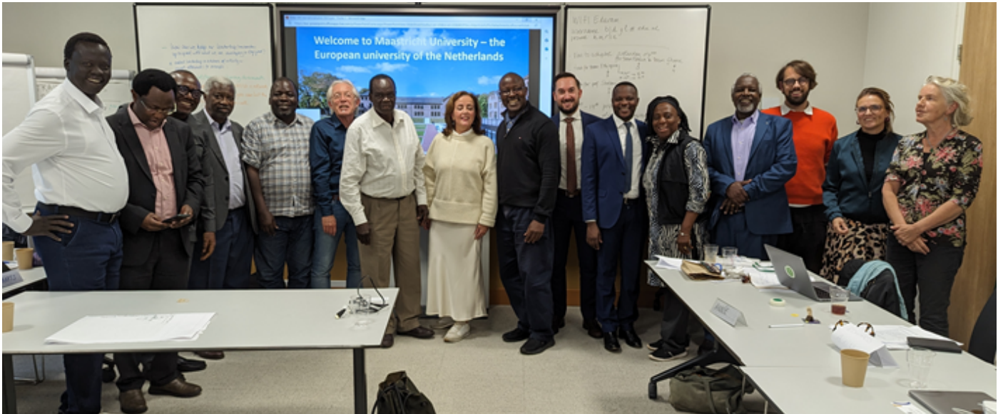
DigiGrad Project Participants during the Seminar at University of Maastricht