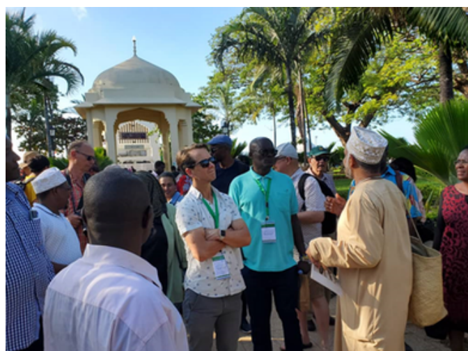
Participants visit some of the historic sites of Zanzibar