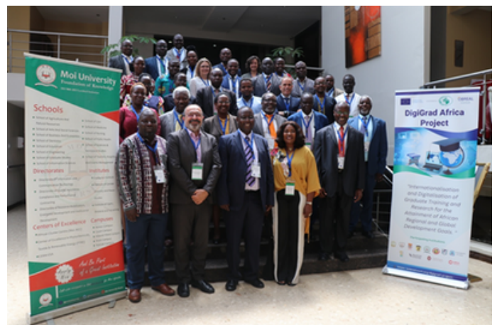
Participants pose for a group photo during the KOM