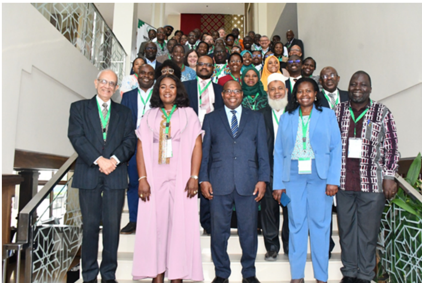
Participants pose for a group photo at the 13th ANIE Conference in Zanzibar