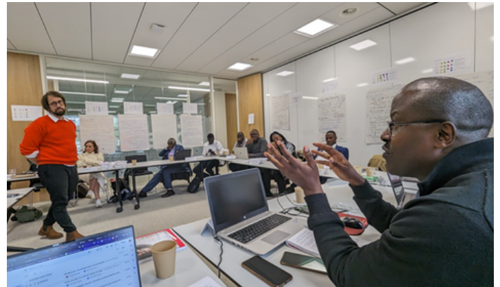
Knowledge exchanges during the seminar