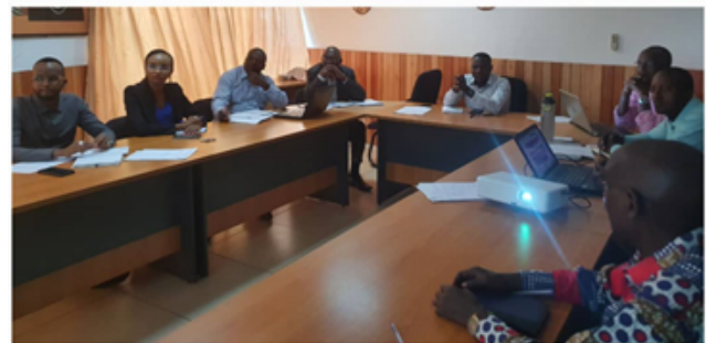
Participants of Bujumbura International University reviewing their strategy