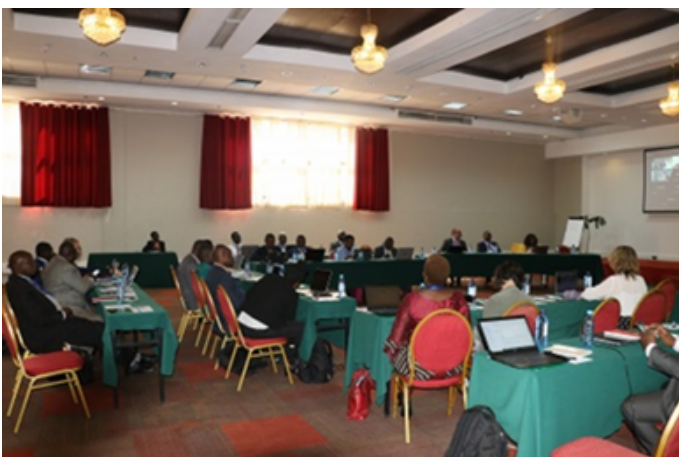
A session in progress during the Kick off meeting

The project brings together both African and European partners. The African partners include: Bujumbura International University, University of Burundi (Burundi); Laweh Open University College, University of Cape Coast (Ghana); Moi University, African Nazarene University (Kenya); University of Juba, Upper Nile University (South Sudan). The European partners included University of Maastricht (Netherlands); Sapienza University (Italy); UC Leuven (Belgium) and University of Extremadura (Spain).